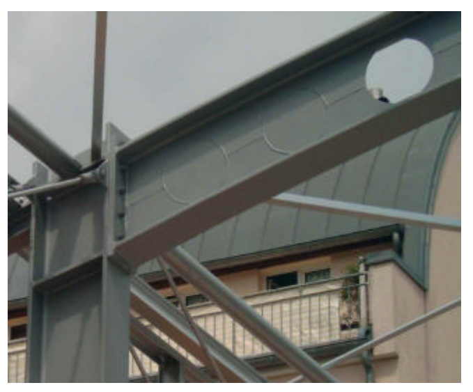
Figure 3. Detail of the connection

All the simulations were made using the FE software SAFIR [4]. The static loads under fire conditions according to prEN1990 [5] were applied.