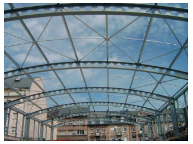
Figure 2. View of the building during construction

The columns are made of steel profile (HEB 500) in grade S235. Although the connection between the columns and the beams is made of 10 bolds flush end plate at level 7.55 m, the connection is considered as rigid to assume the portal frame effect